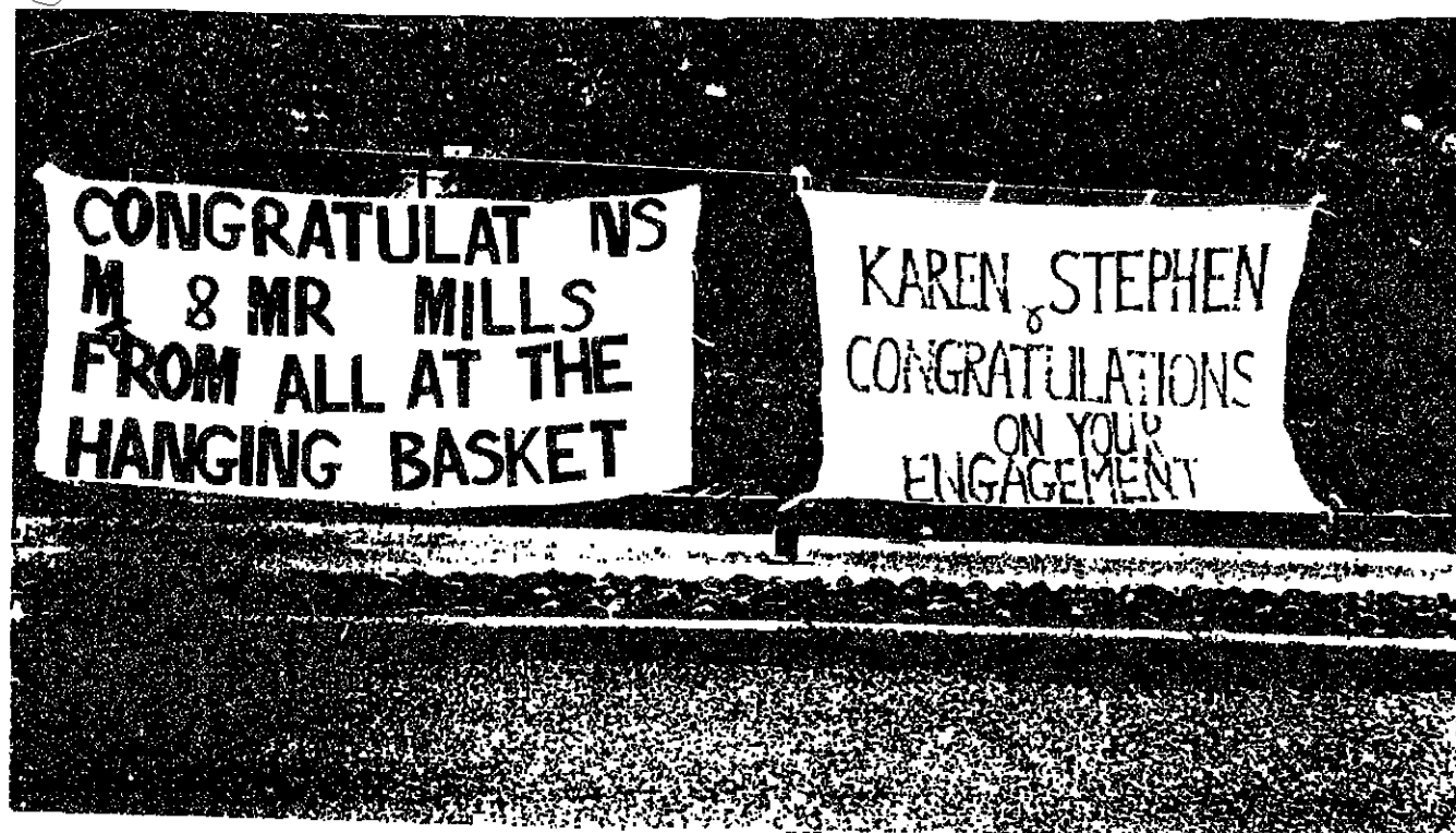
FIGURE 1. LANCASTER, ENGLAND